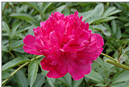
Felix Crousse Peony flowers