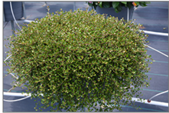
Wire Vine