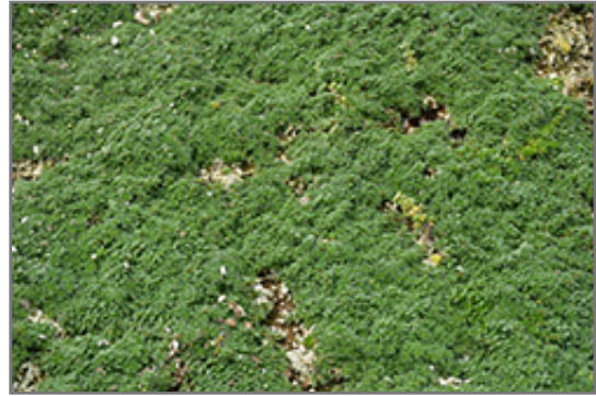
Elfin Creeping Thyme

Elfin Creeping Thyme will grow to be only 2 inches tall at maturity extending to 3 inches tall with the flowers, with a spread of 18 inches. When grown in masses or used as a bedding plant, individual plants should be spaced approximately 16 inches apart. Its foliage tends to remain low and dense right to the ground. It grows at a fast rate, and under ideal conditions can be expected to live for approximately 10 years. As an evergreen perennial, this plant will typically keep its form and foliage year-round.