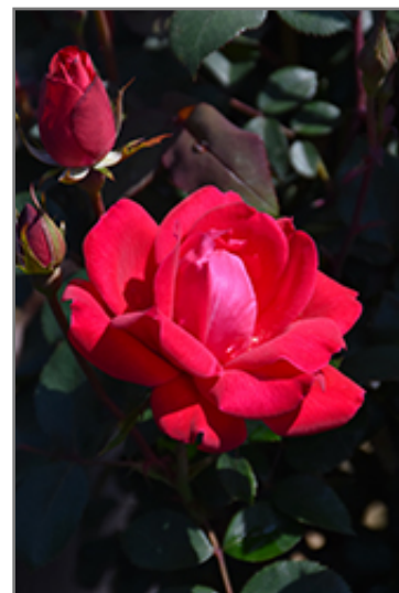
Double Knock Out Rose flowers

Double Knock Out Rose is recommended for the following landscape applications;