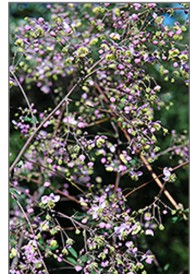
Rochebrun Meadow Rue flowers