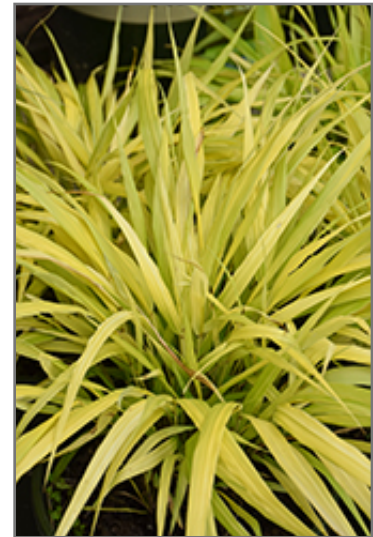
All Gold Hakone Grass foliage