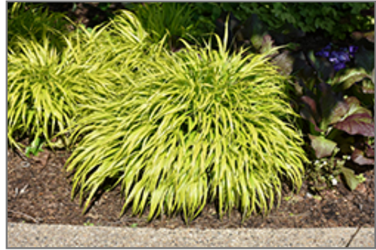
All Gold Hakone Grass