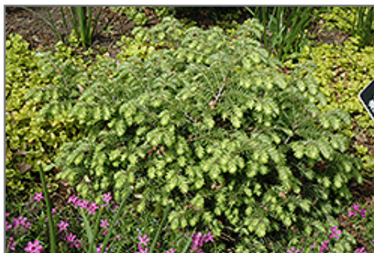
Moon Frost Hemlock

Moon Frost Hemlock is recommended for the following landscape applications;