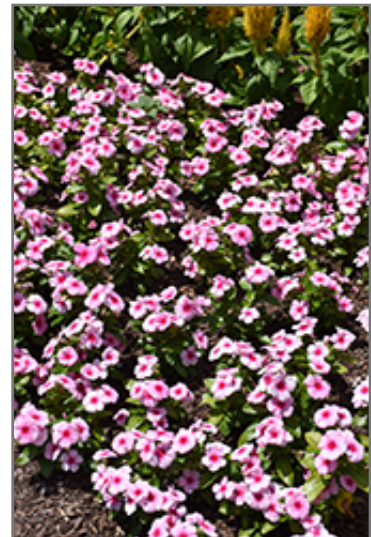
Titan-ium Blush Vinca in bloom