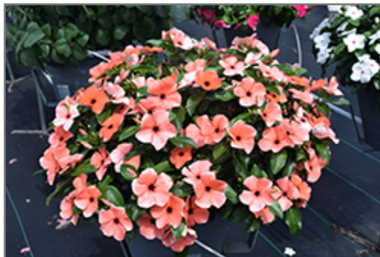
Tattoo Orange Vinca in bloom

Tattoo Orange Vinca will grow to be about 12 inches tall at maturity, with a spread of 8 inches. When grown in masses or used as a bedding plant, individual plants should be spaced approximately 6 inches apart. Its foliage tends to remain dense right to the ground, not requiring facer plants in front. Although it's not a true annual, this fast-growing plant can be expected to behave as an annual in our climate if left outdoors over the winter, usually needing replacement the following year. As such, gardeners should take into consideration that it will perform differently than it would in its native habitat.