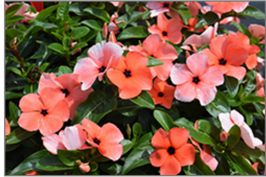
Tattoo Orange Vinca flowers

This plant will require occasional maintenance and upkeep, and should not require much pruning, except when necessary, such as to remove dieback. It is a good choice for attracting butterflies to your yard, but is not particularly attractive to deer who tend to leave it alone in favor of tastier treats. It has no significant negative characteristics.