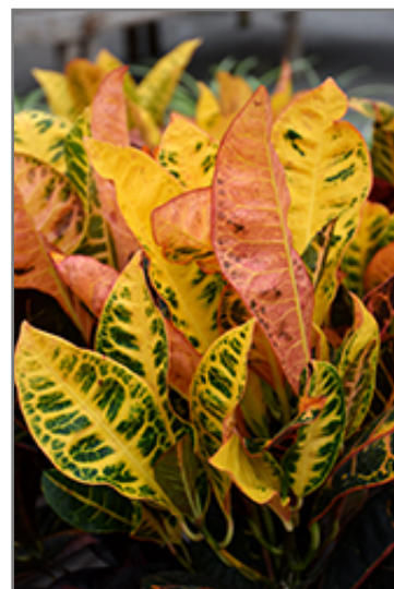
Petra Variegated Croton foliage