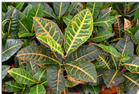
Petra Variegated Croton foliage

Petra Variegated Croton is a fine choice for the garden, but it is also a good selection for planting in outdoor pots and containers. With its upright habit of growth, it is best suited for use as a 'thriller' in the 'spiller-thriller-filler' container combination; plant it near the center of the pot, surrounded by smaller plants and those that spill over the edges. It is even sizeable enough that it can be grown alone in a suitable container. Note that when growing plants in outdoor containers and baskets, they may require more frequent waterings than they would in the yard or garden.