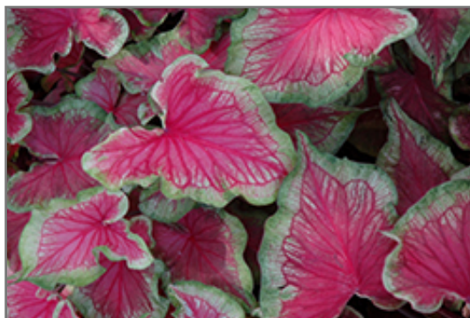
Tiki Torch Caladium foliage