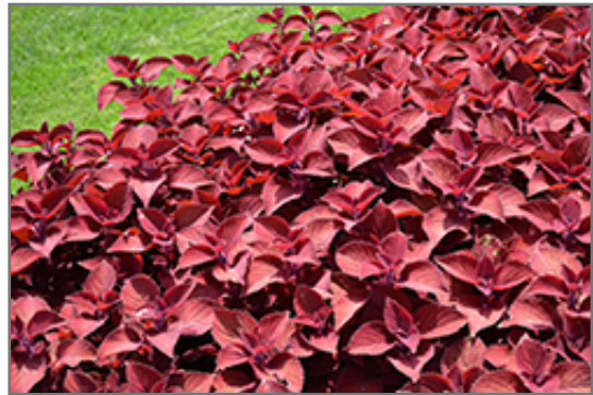
Ruby Slippers Coleus foliage