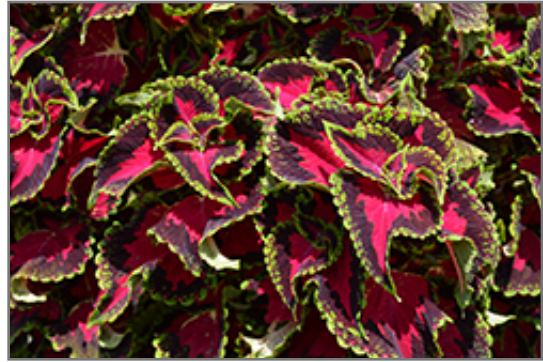
Heartbreaker Coleus foliage

Heartbreaker Coleus is recommended for the following landscape applications;