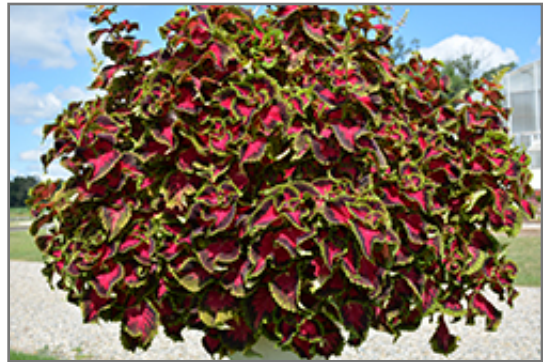
Heartbreaker Coleus