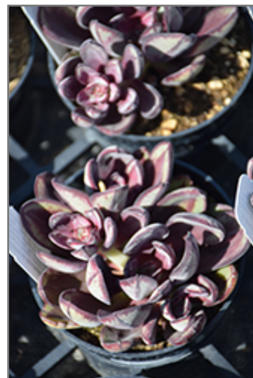
Maruba Benitsukasa Painted Echeveria

This variety produces rosettes of spoon shaped foliage that is olive green, with vivid red variegation that turns burgundy in full sun; foliage features unusual nodules on surface; rose-red flowers in spring; ideal for indoor containers in bright areas