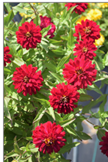
Zydeco Cherry Zinnia flowers

Zydeco Cherry Zinnia is recommended for the following landscape applications;