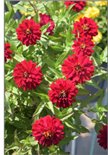
Zydeco Cherry Zinnia flowers

Zydeco Cherry Zinnia is recommended for the following landscape applications;