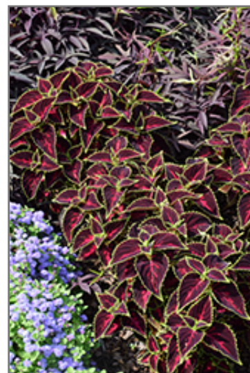
Talavera Pink Tricolor Coleus