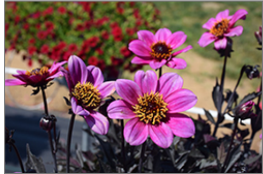
Happy Days Purple Dahlia flowers

Happy Days Purple Dahlia is recommended for the following landscape applications;