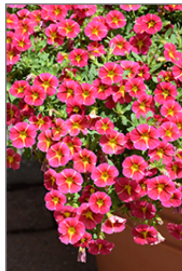
MiniFamous Neo Red Hawaii Calibrachoa flowers

This plant will require occasional maintenance and upkeep. Trim off the flower heads after they fade and die to encourage more blooms late into the season. It is a good choice for attracting bees, butterflies and hummingbirds to your yard, but is not particularly attractive to deer who tend to leave it alone in favor of tastier treats. It has no significant negative characteristics.