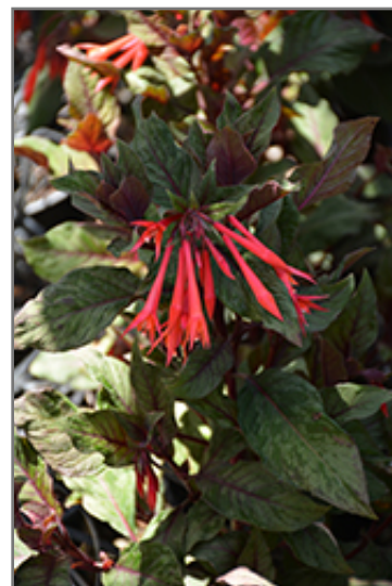
Firecracker Fuchsia flowers

Firecracker Fuchsia is recommended for the following landscape applications;