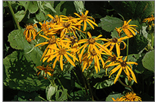
Othello Rayflower flowers