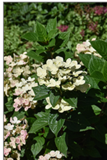
Early Evolution Hydrangea flowers