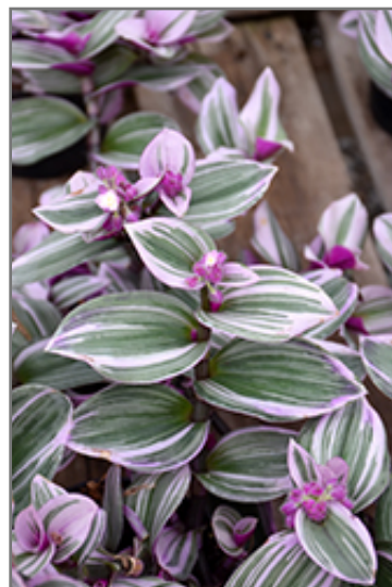
Nanouk Tradescantia foliage

This is an herbaceous evergreen houseplant with a spreading, ground-hugging habit of growth. Its relatively fine texture sets it apart from other indoor plants with less refined foliage. This plant may benefit from an occasional pruning to look its best.