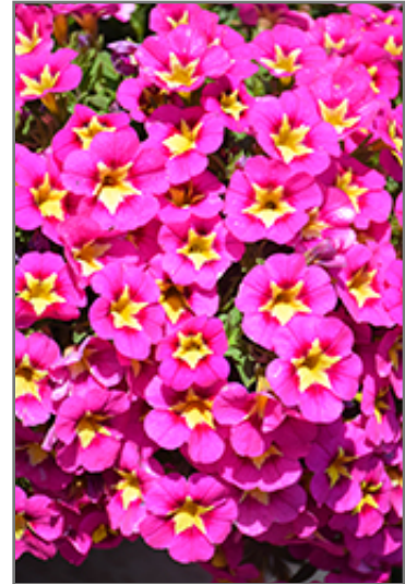
Bumble Bee Hot Pink Calibrachoa flowers

This plant will require occasional maintenance and upkeep. Trim off the flower heads after they fade and die to encourage more blooms late into the season. It is a good choice for attracting bees and hummingbirds to your yard, but is not particularly attractive to deer who tend to leave it alone in favor of tastier treats. It has no significant negative characteristics.