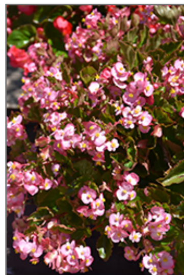
Hula Pink Begonia flowers