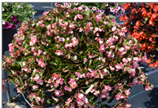
Hula Pink Begonia in bloom