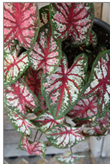
Heart to Heart Bottle Rocket Caladium foliage

This riveting variety offers splashes of color and spectacular contrast; features eye-catching foliage with bright red centers and veins with white panes and a deep green border; a wonderful shade landscape accent; a great container plant, indoors or out