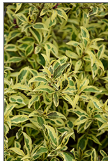
Bubbly Wine Weigela foliage

Bubbly Wine Weigela is recommended for the following landscape applications;