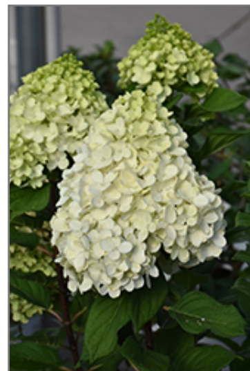
Little Lime Punch Hydrangea flowers