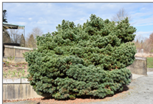
Blue Shag White Pine