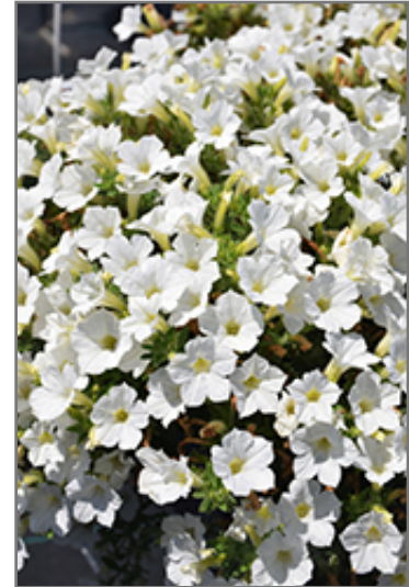
Itsy White Petunia flowers

This plant will require occasional maintenance and upkeep. Trim off the flower heads after they fade and die to encourage more blooms late into the season. It is a good choice for attracting bees, butterflies and hummingbirds to your yard, but is not particularly attractive to deer who tend to leave it alone in favor of tastier treats. It has no significant negative characteristics.