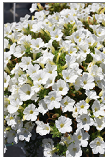
Itsy White Petunia flowers

This plant will require occasional maintenance and upkeep. Trim off the flower heads after they fade and die to encourage more blooms late into the season. It is a good choice for attracting bees, butterflies and hummingbirds to your yard, but is not particularly attractive to deer who tend to leave it alone in favor of tastier treats. It has no significant negative characteristics.