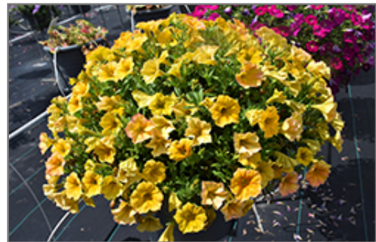
SuperCal Premium Yellow Sun Petchoa in bloom