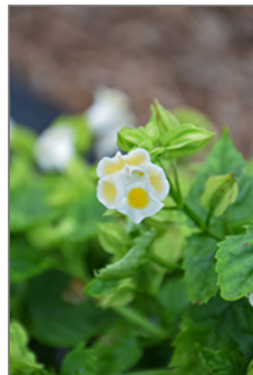
Kauai Lemon Drop Torenia flowers

Kauai Lemon Drop Torenia is recommended for the following landscape applications;