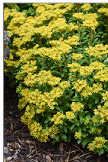
Rock 'N Round Bright Idea Stonecrop in bloom