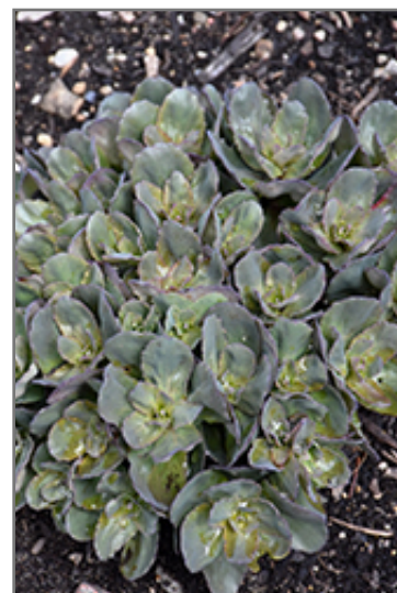
Rock 'N Grow Back in Black Stonecrop foliage