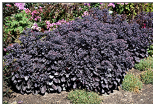
Rock 'N Grow Back in Black Stonecrop in bloom

Rock 'N Grow Back in Black Stonecrop is a dense herbaceous perennial with an upright spreading habit of growth. Its relatively coarse texture can be used to stand it apart from other garden plants with finer foliage.