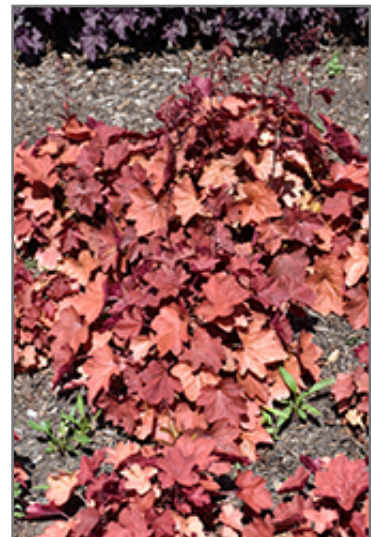
Carnival Cinnamon Stick Coral Bells