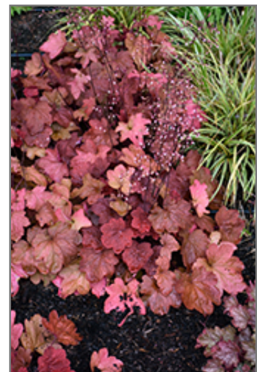
Carnival Cinnamon Stick Coral Bells in bloom