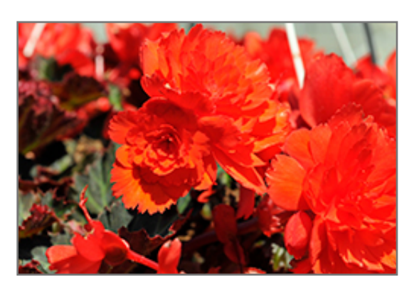
l'Conia Portofino Hot Coral Begonia flowers