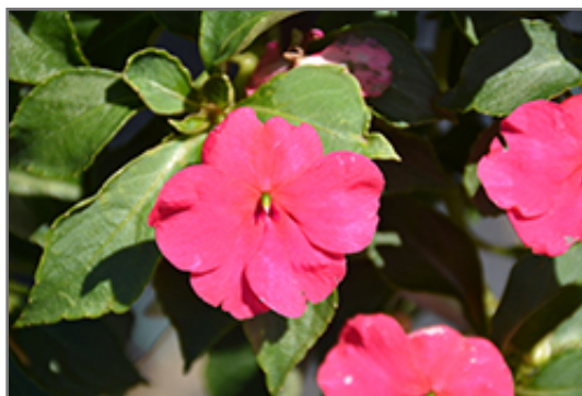
Beacon Rose Impatiens flowers