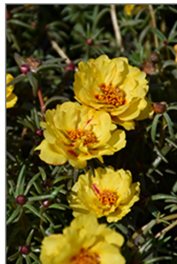
Happy Hour Banana Portulaca flowers

Happy Hour Banana Portulaca is recommended for the following landscape applications;