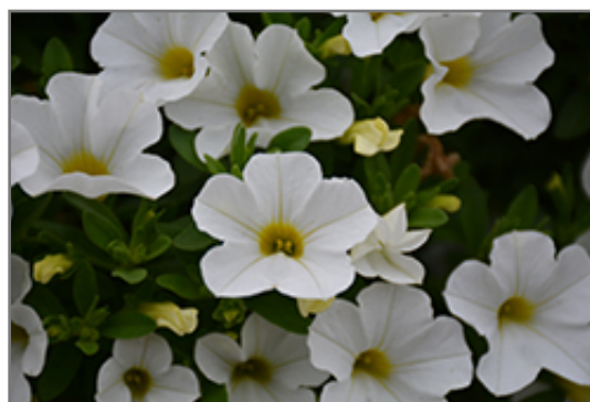
MiniFamous Uno White Calibrachoa flowers