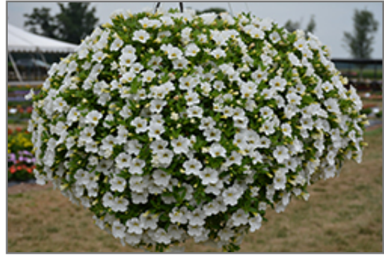
MiniFamous Uno White Calibrachoa in bloom