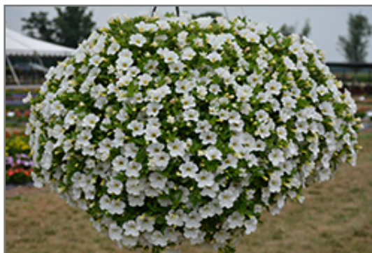
MiniFamous Uno White Calibrachoa in bloom