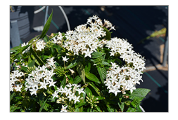
Lucky Star White Star Flower flowers