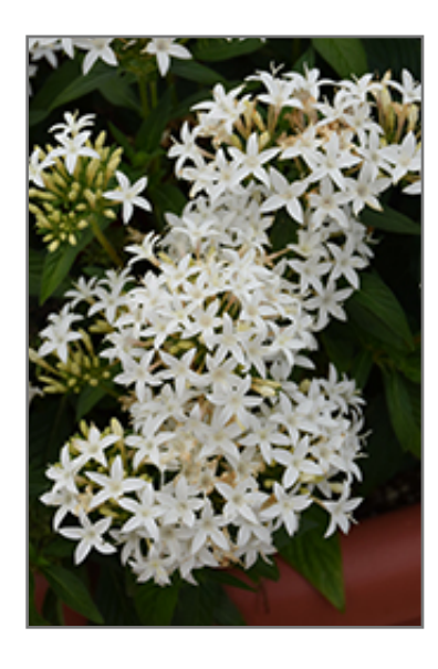
Lucky Star White Star Flower flowers