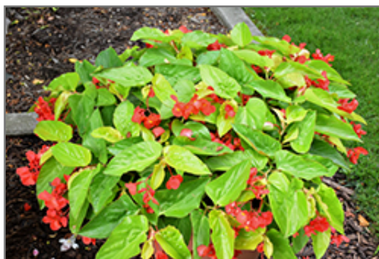
Canary Wings Begonia in bloom