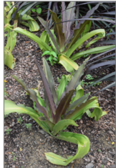
African Night Pineapple Lily

African Night Pineapple Lily is a fine choice for the garden, but it is also a good selection for planting in outdoor pots and containers. With its upright habit of growth, it is best suited for use as a 'thriller' in the 'spiller-thriller-filler' container combination; plant it near the center of the pot, surrounded by smaller plants and those that spill over the edges. It is even sizeable enough that it can be grown alone in a suitable container. Note that when growing plants in outdoor containers and baskets, they may require more frequent waterings than they would in the yard or garden.