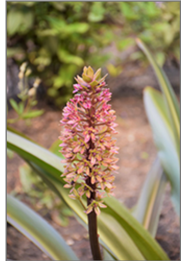
African Night Pineapple Lily flower buds

African Night Pineapple Lily is recommended for the following landscape applications;