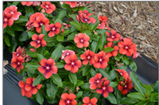
Tattoo Tangerine Vinca in bloom