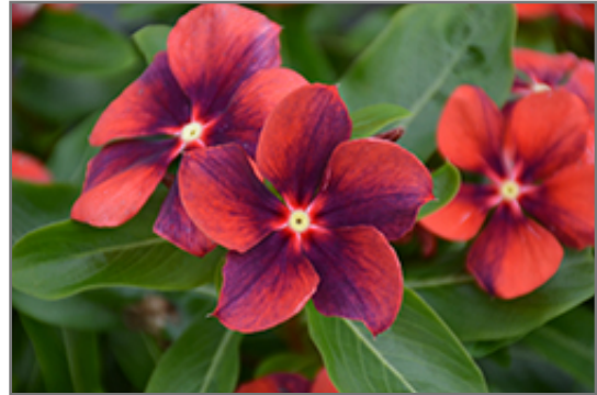
Tattoo Tangerine Vinca flowers

This plant will require occasional maintenance and upkeep, and should not require much pruning, except when necessary, such as to remove dieback. It is a good choice for attracting butterflies to your yard, but is not particularly attractive to deer who tend to leave it alone in favor of tastier treats. It has no significant negative characteristics.