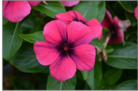
Tattoo Raspberry Vinca flowers

This plant will require occasional maintenance and upkeep, and should not require much pruning, except when necessary, such as to remove dieback. It is a good choice for attracting butterflies to your yard, but is not particularly attractive to deer who tend to leave it alone in favor of tastier treats. It has no significant negative characteristics.