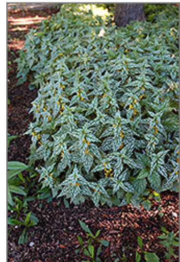
Hermann's Pride Yellow Archangel in bloom