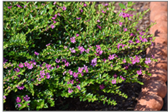
FloriGlory Diana Mexican Heather flowers

FloriGlory Diana Mexican Heather will grow to be about 14 inches tall at maturity, with a spread of 24 inches. When grown in masses or used as a bedding plant, individual plants should be spaced approximately 18 inches apart. Its foliage tends to remain dense right to the ground, not requiring facer plants in front. Although it's not a true annual, this fast-growing plant can be expected to behave as an annual in our climate if left outdoors over the winter, usually needing replacement the following year. As such, gardeners should take into consideration that it will perform differently than it would in its native habitat.