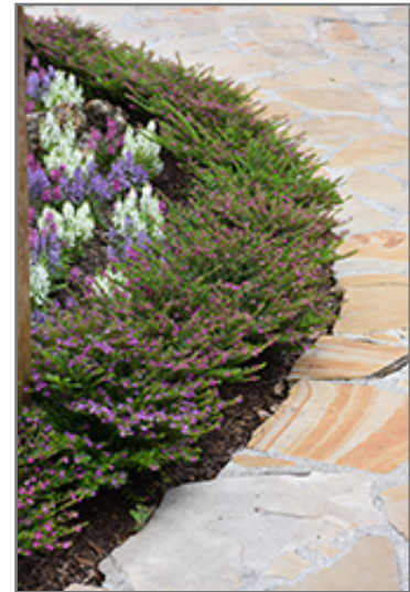
FloriGlory Diana Mexican Heather flowers

FloriGlory Diana Mexican Heather is recommended for the following landscape applications;