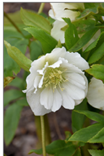
Wedding Party Wedding Bells Hellebore flowers

This elegant variety produces vigorous mounds of thick evergreen leaves; flower stalks, held occasionally above the foliage bear showy white double flowers with buttery anthers and chartreuse eyes; an outstanding selection for shade gardens