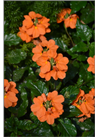
Orange Marmalade Firecracker Plant flowers

This plant does best in full sun to partial shade. It does best in average to evenly moist conditions, but will not tolerate standing water. It is not particular as to soil pH, but grows best in rich soils. It is somewhat tolerant of urban pollution. This is a selected variety of a species not originally from North America. It can be propagated by cuttings; however, as a cultivated variety, be aware that it may be subject to certain restrictions or prohibitions on propagation.