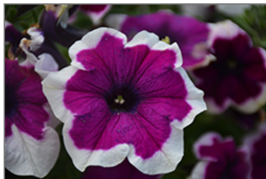
Crazytunia Passion Punch Petunia flowers

This plant will require occasional maintenance and upkeep. Trim off the flower heads after they fade and die to encourage more blooms late into the season. It is a good choice for attracting butterflies and hummingbirds to your yard, but is not particularly attractive to deer who tend to leave it alone in favor of tastier treats. It has no significant negative characteristics.