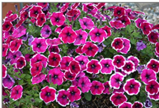
Crazytunia Passion Punch Petunia flowers

Crazytunia Passion Punch Petunia will grow to be about 10 inches tall at maturity, with a spread of 12 inches. When grown in masses or used as a bedding plant, individual plants should be spaced approximately 10 inches apart. Its foliage tends to remain low and dense right to the ground. This fast-growing annual will normally live for one full growing season, needing replacement the following year.