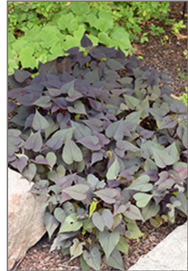
Sweet Georgia Heart Purple Sweet Potato Vine