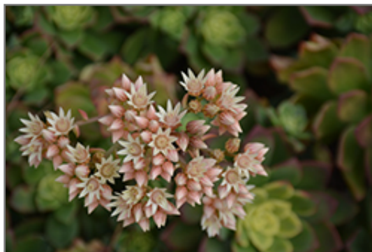
Kiwi Aeonium flowers